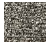
Silver (C/M POD Only)